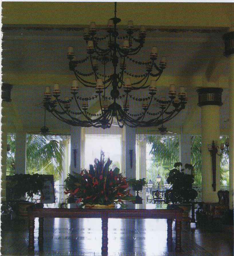
The Hotel Riu Tropical Bay's stunning open-air lobby welcomes guests from around the world.

The entire grounds features statues, Roman-style fountains, and naturally, lush flowers, plants and palm trees. Immaculately kept, the grounds are beautiful.