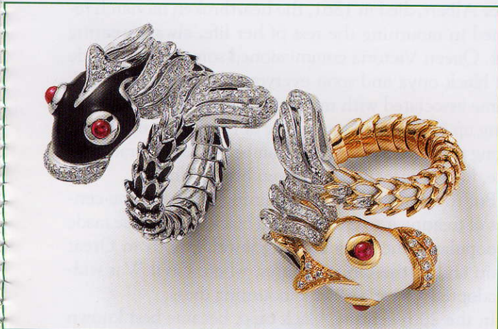
Roberto Coin Nemo Rings in 18K gold with black or white enamel, rubies and diamonds. robertocoin.com .