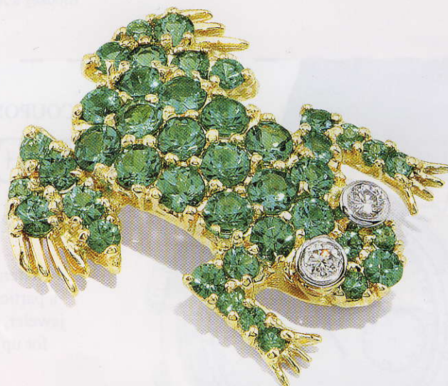
From Aaron Henry , this whimsical 18-karat gold brooch is set with green tsavorites and diamond eyes. Aaronhenry.com .

Everywhere one turns this season, animal influences abound. From the runways to the ready-to-wear collections, from handbags to footwear to hats, coats and accessories – leopard prints, tiger stripes and zebras are all the rage. So, of course, jewelry is equally inspired to bring out the wild side of life. From Africa to Asia, from earth to sky and water – animal jewelry is the key to keeping customers happy this season and to ringing up sales.