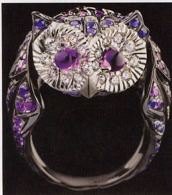
From Boucheron , this Chouette Owl ring is crafted in 18-karat white gold and set with amethysts, violet sapphires and diamonds. Boucheron.com .