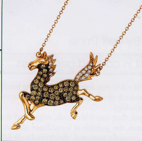
From the LeVian Derby™ Collection, this Horse necklace is crafted in 14-karat Strawberry gold with a Chocolate Diamond® body and white diamond-studded mane and tail. Levian.com .