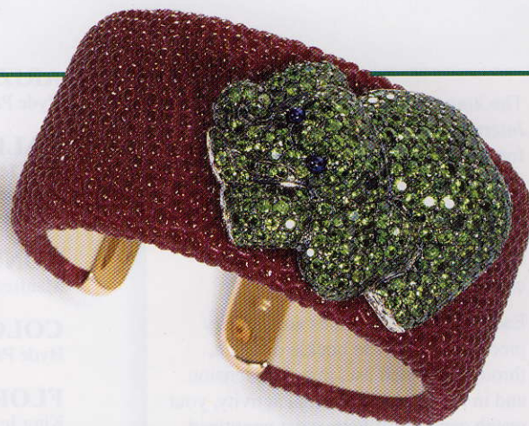
Crafted on a stingray strap, this Elephant cuff bracelet from deGrisogono features a tsavorites-set elephant with sapphire eyes. Degrisogono.com .